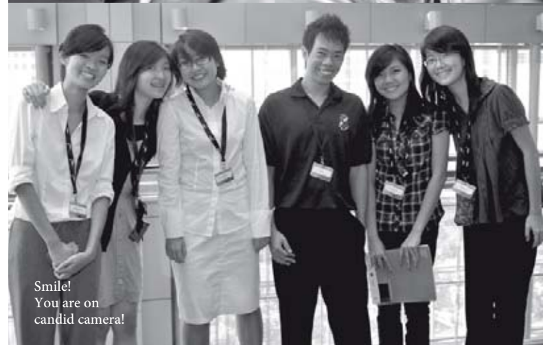
Smile! You are on candid camera!