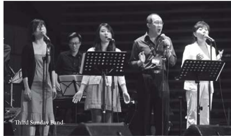
Third Sunday Band