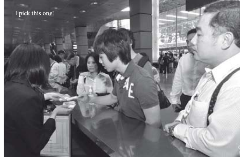
I pick this one!